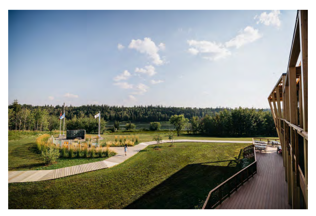
The veteran's monument — made of concrete, aluminum, glass and paver stones with landscaping — commemorates the Métis soldiers who fought for the rights of their own people and, in our own time, for Canada and its allies.