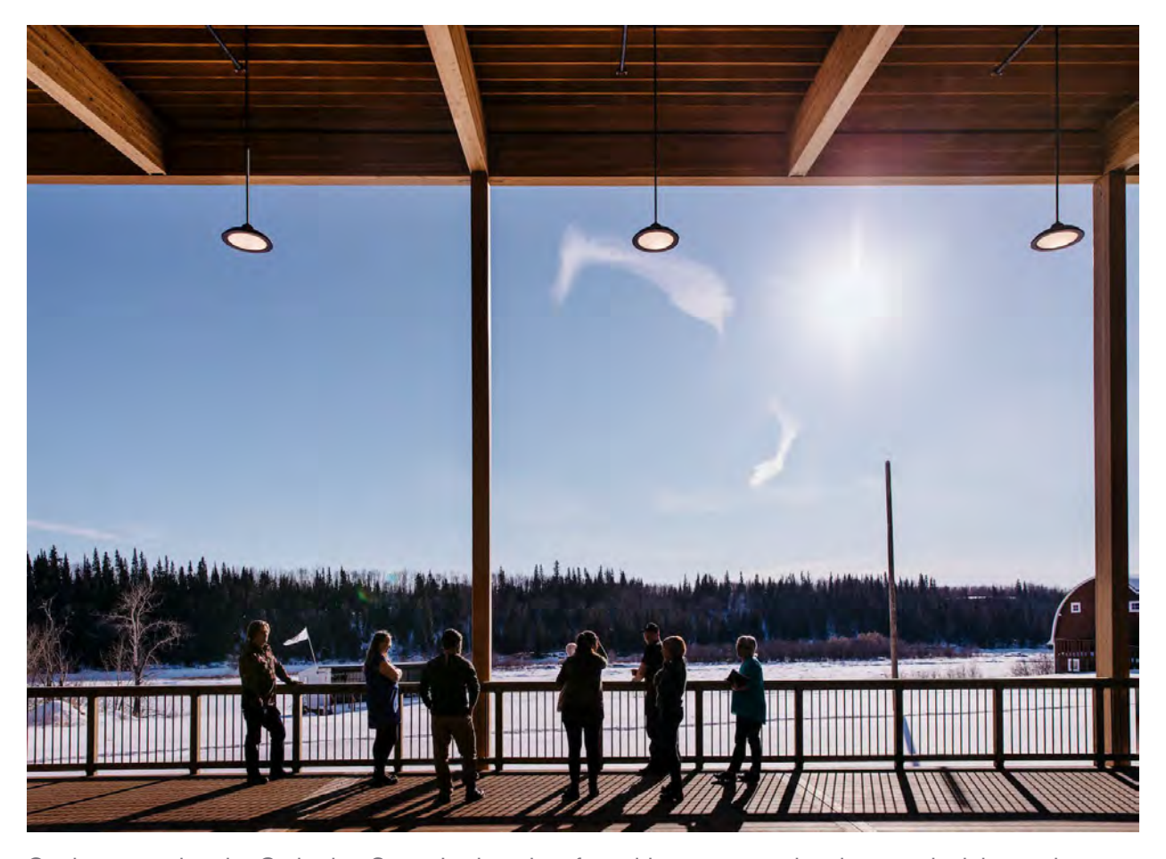
On the upper tier, the Gathering Centre's sloped roof provides an expansive river overlook beneath Accoya rafters

Where is the river?" She goes on to explain, "If we open up to the south and we orientate our buildings east—west, we optimize solar orientation, reduce the demand for cooling, optimize natural ventilation, and we shade on the south." These basic rules of sustainable design also align with the fundamentals of Indigenous cosmologies. The sun and water are our sources of life; we need to turn toward them. So the complex aligns with the east—west path of the sun as it stretches along the Victoria Trail and the North Saskatchewan River. This layout also acknowledges the status of this trail as a national historic site and accommodates the local rural structure plan, which limits all new buildings to two storeys, insists on pitched roofs and calls for orientation toward the trail.