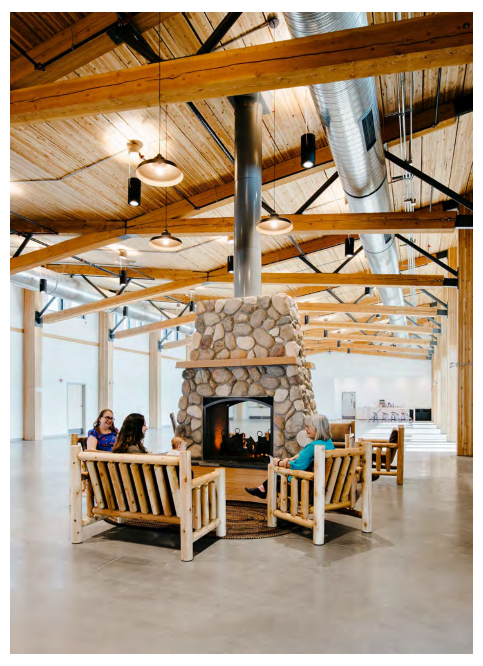
Inspired by the Métis one-room home, the inside of the Centre is capacious and warm, anchored by crisscrossing ceiling beams. It also features a stone fireplace, and finishes of fir, maple and birch.

this truss suggests the infinity symbol of the Métis people, but this is only one way that this building might be seen as a "Métis space." One upper cord of the truss springs beyond the south wall of the building to shelter an immense double-height space facing the river, providing the overlook characteristic of Métis homesteads. But this southern "front porch" serves multiple other purposes: It shades the building from solar gain, facilitates crossand stack-effect ventilation and provides an overflow space for the main hall with specific social nuances.