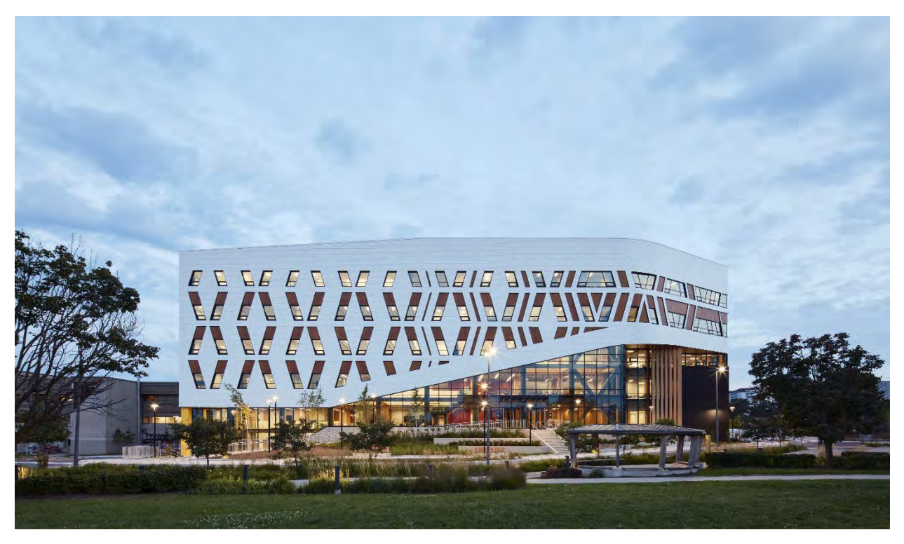
A-Building Expansion at Progress Campus