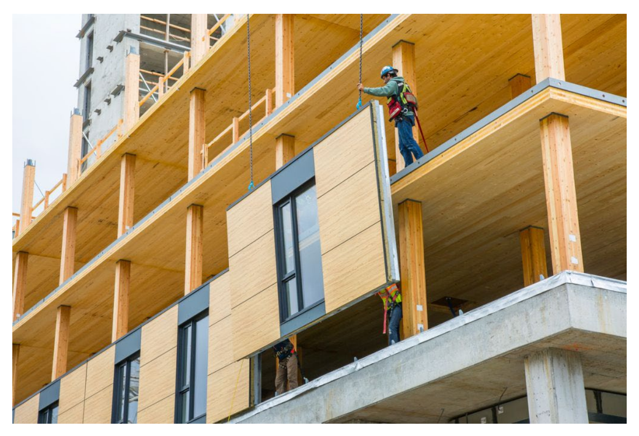
The Brock Commons Tallwood House on the University of British Columbia's campus in Vancouver, B.C. The building is one of hundreds of mass timber projects in B.C.