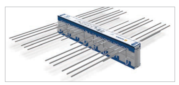
Schöck Isokorb<sup>®</sup> concrete-to-concrete structural thermal break transfers bending moments and shear forces, while preventing heat energy waste, chilled interior floors, and formation of condensation and mould.

At the connection points, the design team specified Isokorb® concrete-to-concrete and concreteto-steel structural thermal breaks from Schöck North America. Each concrete-to-concrete module consists of a rigid foam block penetrated by stainless steel rebar that is tied into rebar on both sides of the slab or wall before concrete is poured conventionally. Each concrete-to-steel