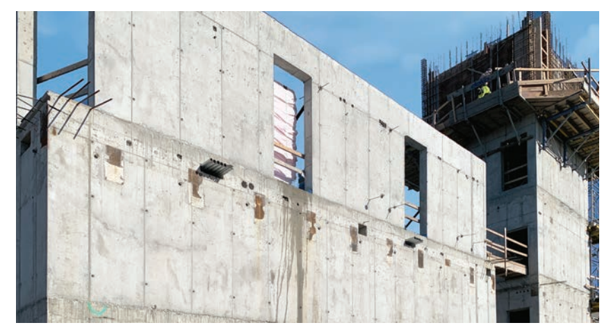
The main building at left and the training tower at right are structurally integrated on four levels but thermally isolated with Isokorb<sup>®</sup> concrete-to-concrete and concrete-to-steel structural thermal breaks.