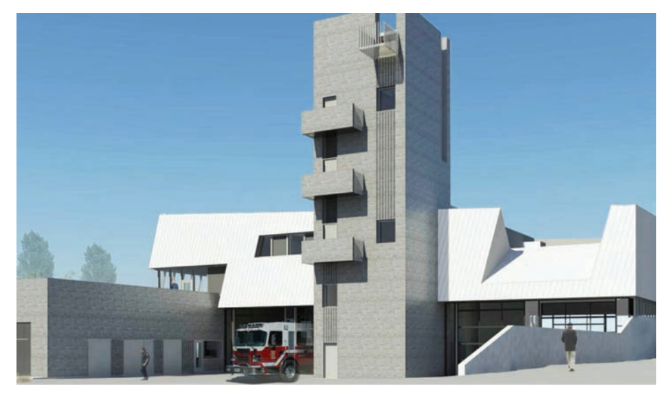
The fire hall has a sturdy concrete structure that serves as an armature for a steel frame on the upper levels where the exterior walls slope toward the central tower. The living and administration areas are thermally isolated from the apparatus bay below and the six-storey training tower with a variety of structural thermal breaks.

"Our need to address thermal bridging led us to structural thermal breaks," says Federica Piccone, architect with HCMA.