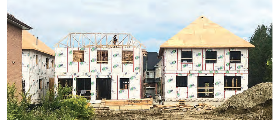
Excel Exterior Structural, Continuously Insulated Sheathing.

Excel's 1.5 R-value is three times that of Oriented Strand Board (OSB), and its use instead of OSB can negate the need for drain water heat recovery units. Excel's built-in air barrier also negates the cost of wrapping a house, which also translates into substantial time and labour savings. Both Excel and R-5 XP (installed blue side out) offer an integrated external air barrier after the joints are taped. "This is a structural wall in addition to being an external air barrier," says Lowes. "The product has undergone extensive strength testing at an independent laboratory, with amazing results."